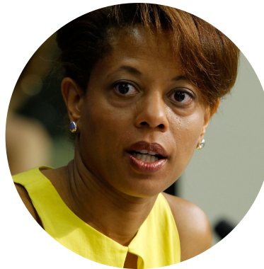
Melody Barnes Director of the White House Domestic Policy Council Collective Impact & Opportunity Youth (2013)